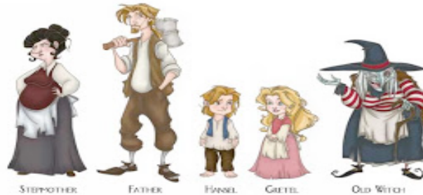
HANSEL & GRETEL CHARACTERS LINE-UP

Gordon Gumshoe Fairy Tale Detective incorporates stories usually attributed to the famous German storytelling duo known as the Brothers Grimm. Professors Wilhelm and Jacob Grimm did not create these stories; but they did record folklore from around the world that was passed down for generations. The Brothers Grimm compiled 86 local German legends and fairy tales into their first volume of Kinder-und Hausmärchen published in 1812. Ultimately, more stories were collected resulting in eight published editions of Kinder-und Hausmärchen containing 200 folktales and 10 children's legends.